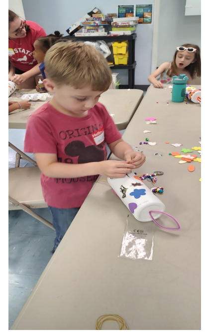
Recycling plastic containers into a wind chime.