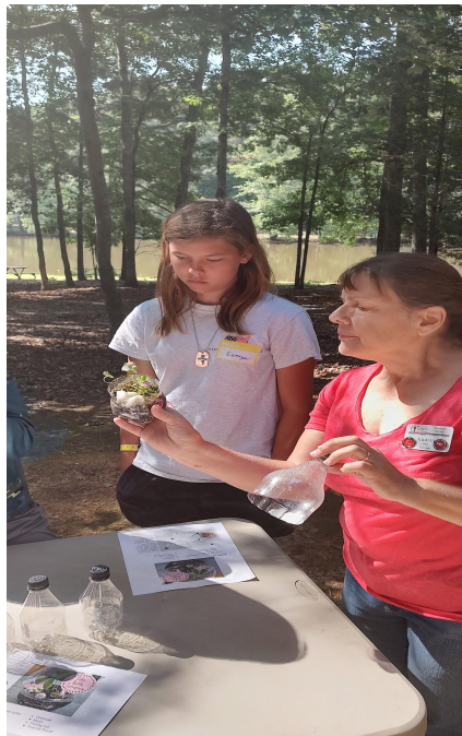
EMGV assist with plant education & terrarium making.