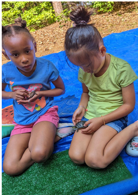
Turtle, turtle! Youth really enjoyed learning about turtles!