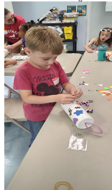
Recycling plastic containers into a wind chime.