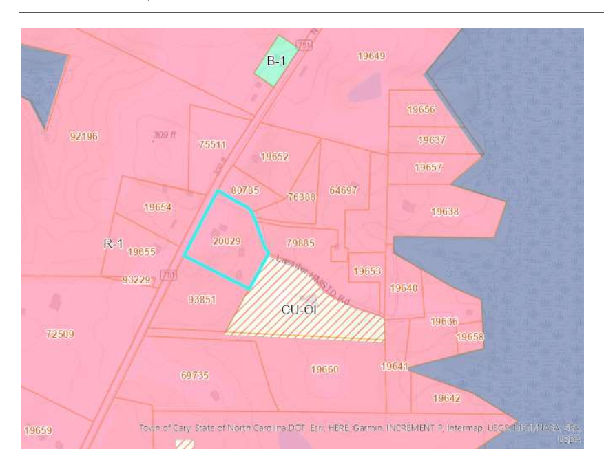
File #: 21-3736, Version: 2