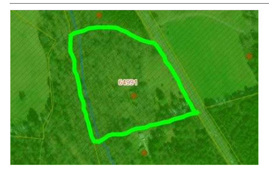
File #: 21-3730, Version: 2

The Planning Board discussed this item during their December 1, 2020 meeting and discussion included the existing dwelling, time of employees on site, times dogs would be outside, soundproofing of the building, and landscaping. The applicant stated the existing dwelling is a sore thumb and will be removed, with the boarding kennel improving the appearance of the property. There will be cameras installed for 24 hour surveillance, and the owner will be available to visit the property if necessary. The doors for the runs will open in the morning (7:00 AM) and all doors will be down at close (6:00 PM). The applicant will be there the majority of the time. The applicant is working with a builder to find the best solution to soundproof the building, the doggie doors will have insulation, and they may have paneling in the ceiling to mitigate noise leaving the building. The applicant also noted that noise dampening was needed inside the building to reduce stress on the dogs. The landscaping was clarified from the CCAC minutes in which planning staff had listed an invasive species, but it was corrected (Ligustrum to Camillia). The Planning Board recommended by unanimous vote to approve the requested amendment.