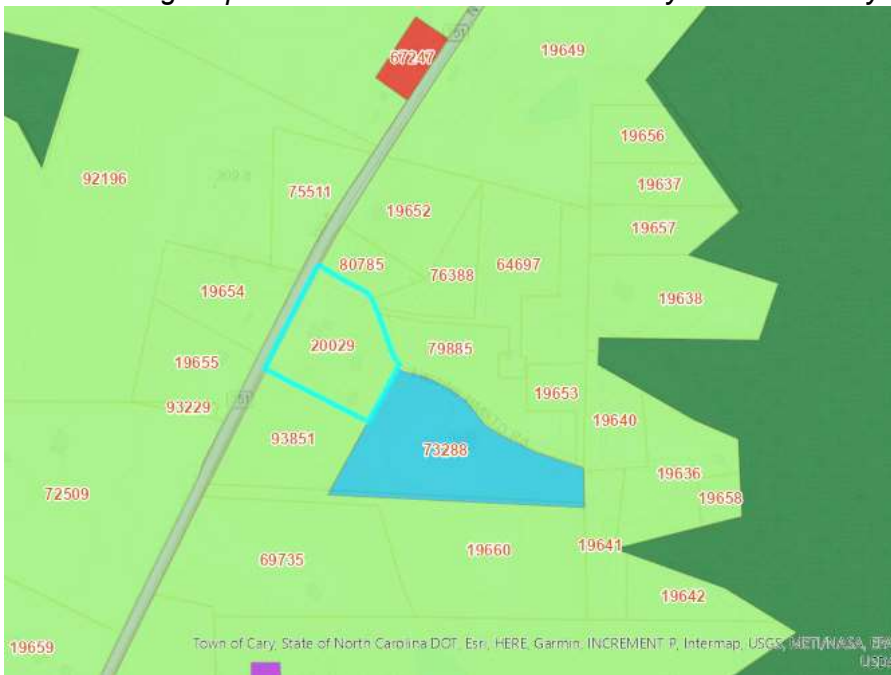
The following map shows the Joint Chatham County - Town of Cary Plan Map

It is the planning staff opinion and Planning Board recommendation, this standard has been met.