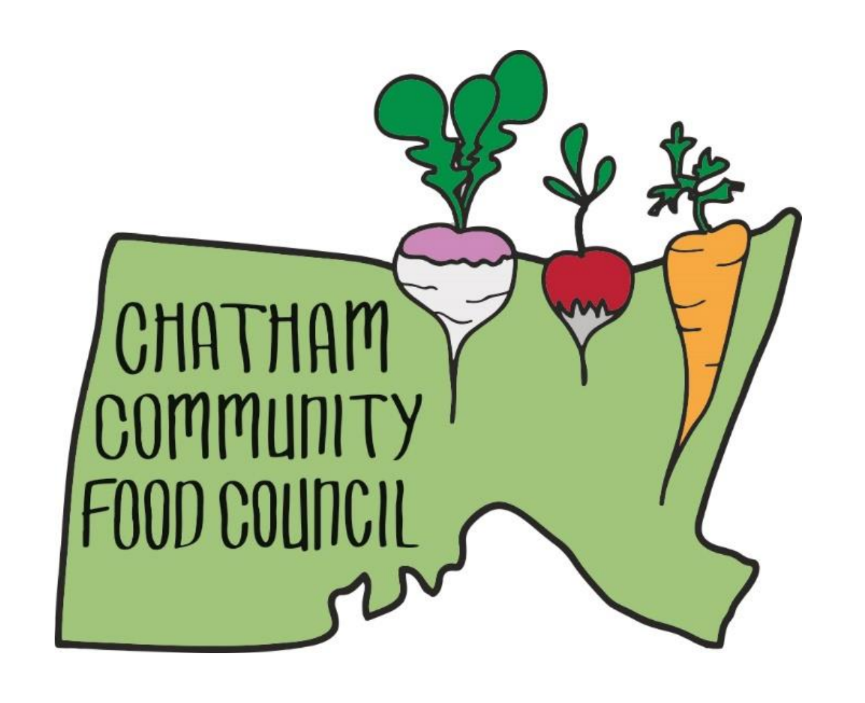
Report to the Commissioners October 2020