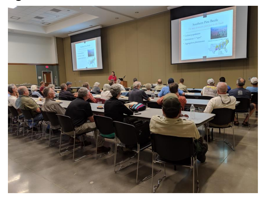
Forestry Pest Management Workshop

14 workshops for 835 farmers, gardeners, and forest landowners