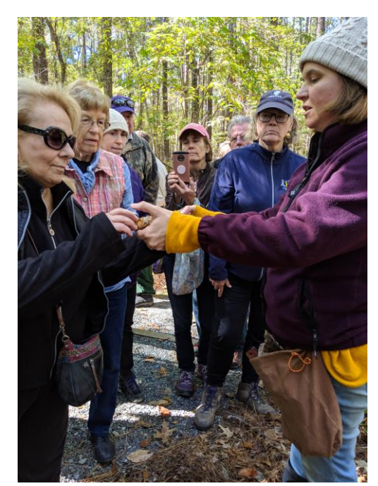
CCP Wild Mushroom Meeting