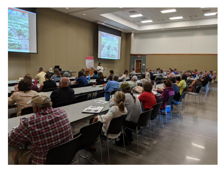
Produce Safety Farmer Workshop