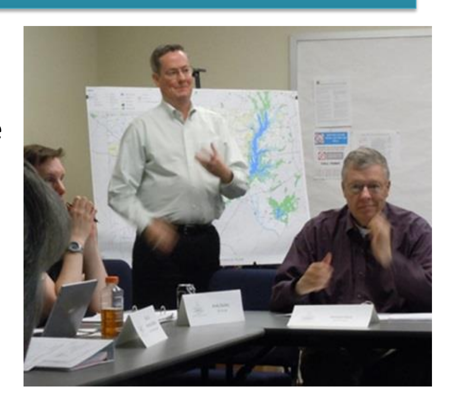
The draft plan should be completed in the next few months