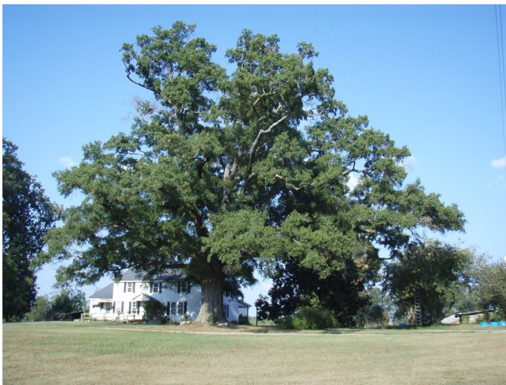
Chatham County Champion Willow Oak