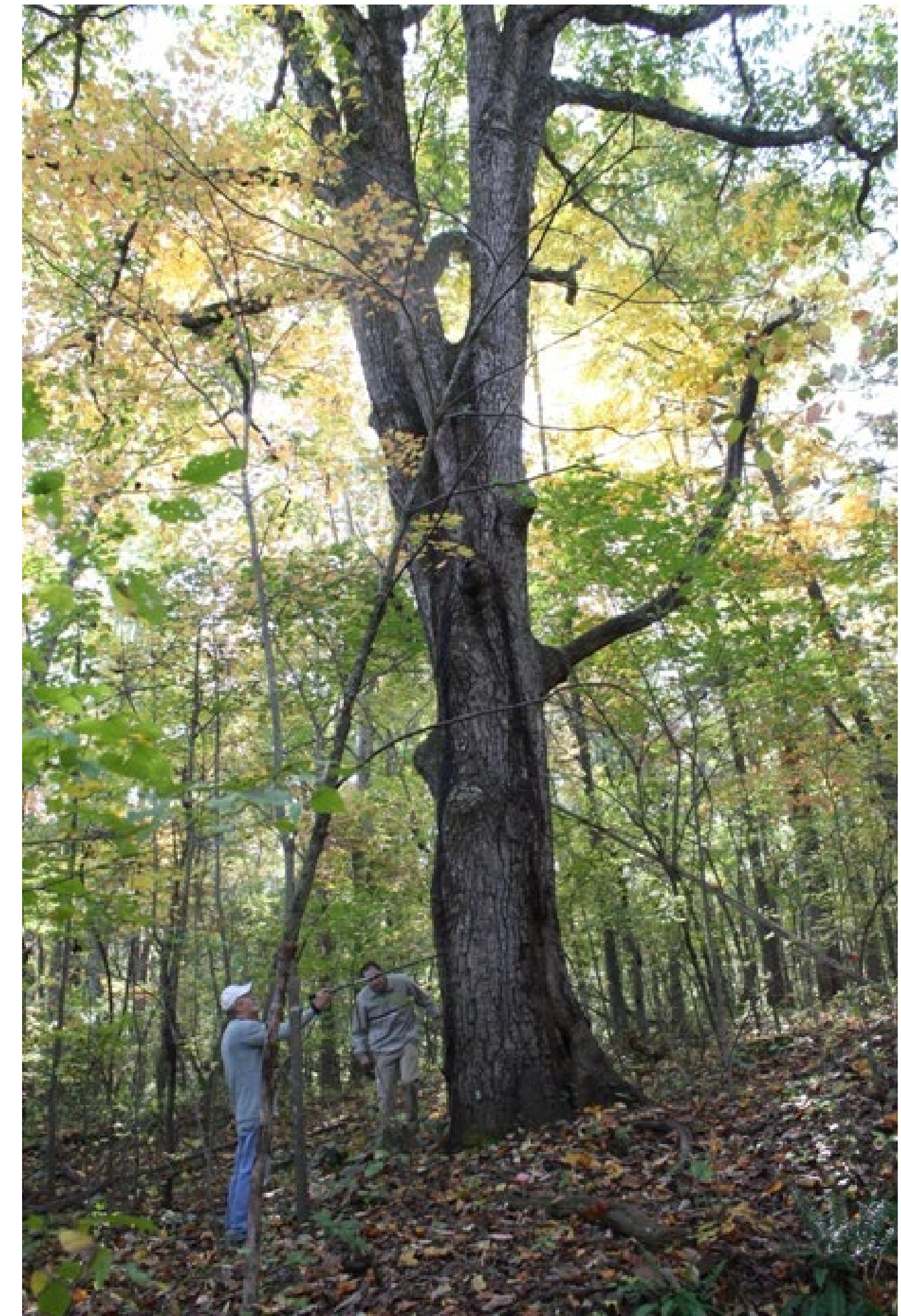
Landmark Chestnut Oak Group