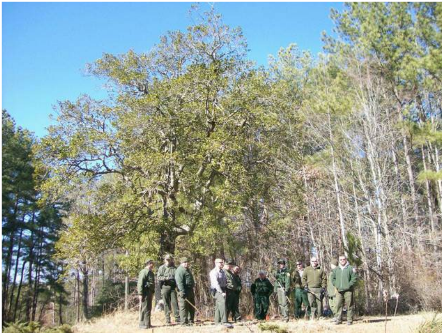
Meritorious American Holly at Ebenezer Church