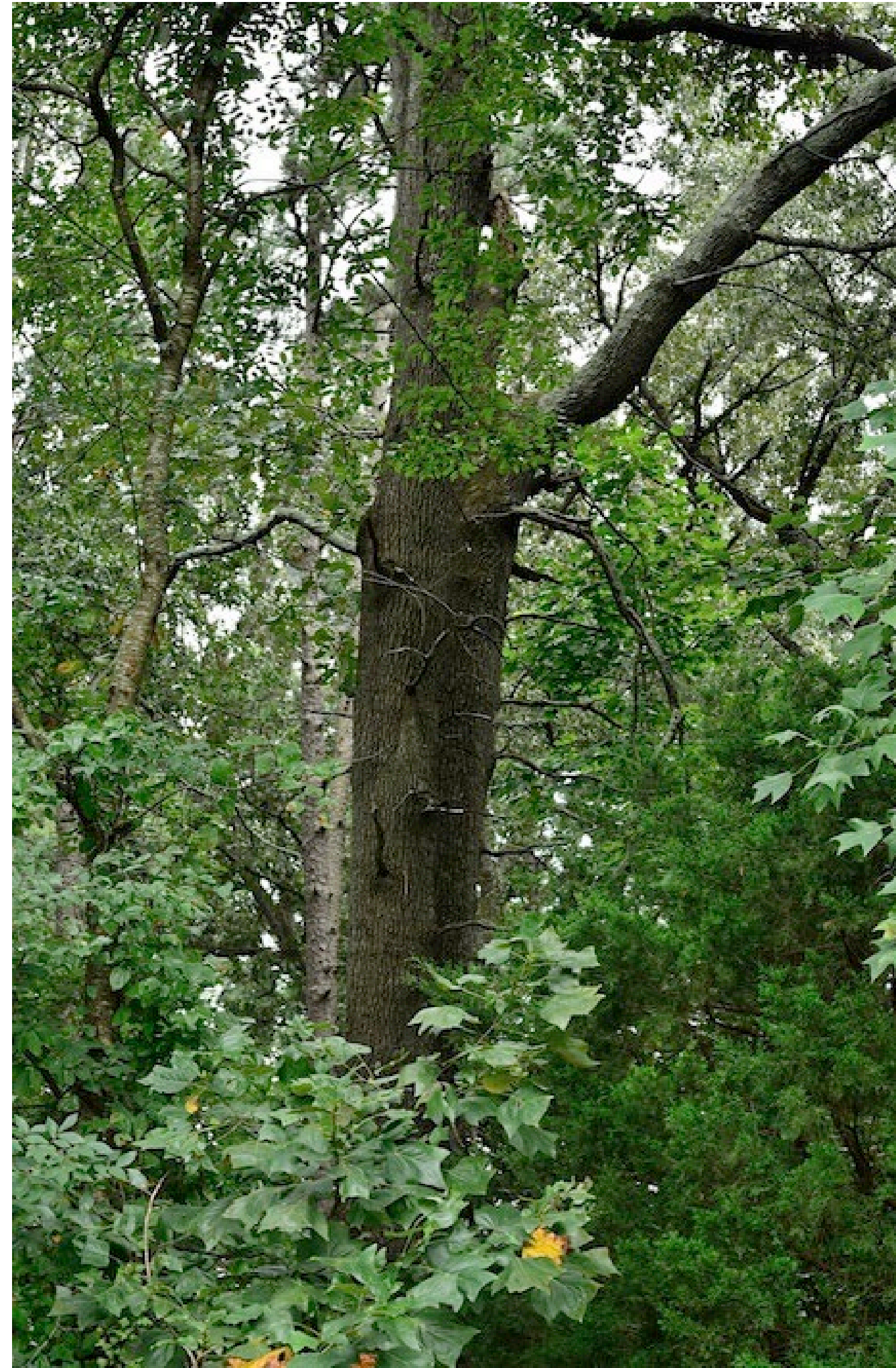
National Champion Blackjack Oak