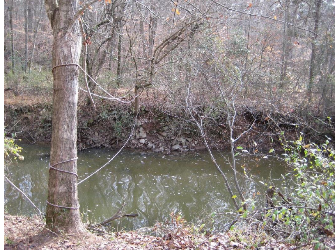
Pokeberry Bridge Location funded through the Recreational Trail Program Grant received due to the RAC's letter of support