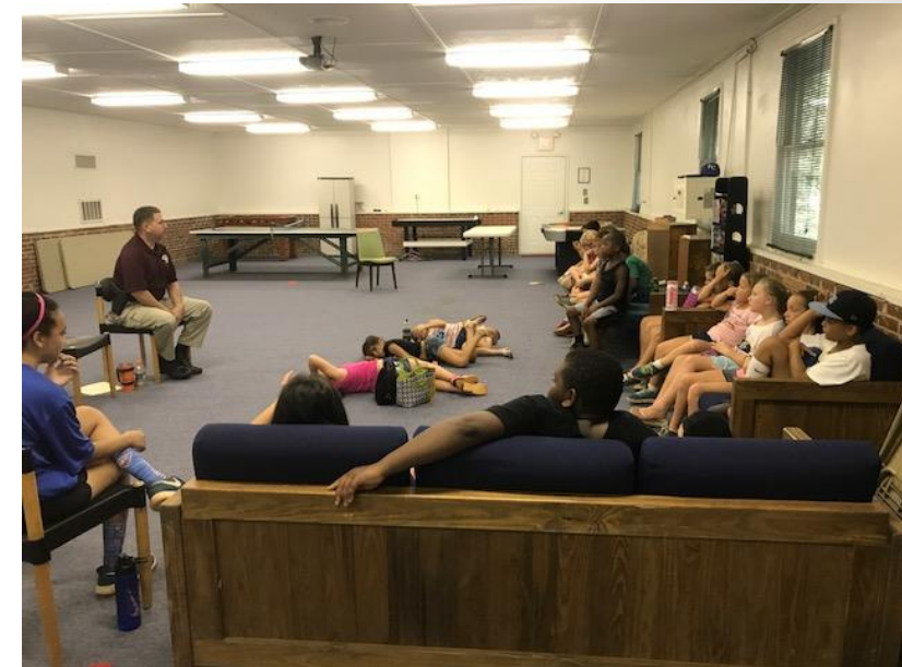
Summer Campers learning about nature from the several nature education speakers. Deputy talks with the youth at summer camp.