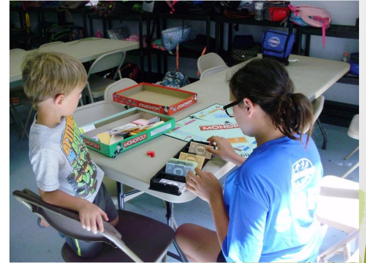
CCP&R Northwest Park Dining Hall where Summer camp meets to play board games and eat lunch