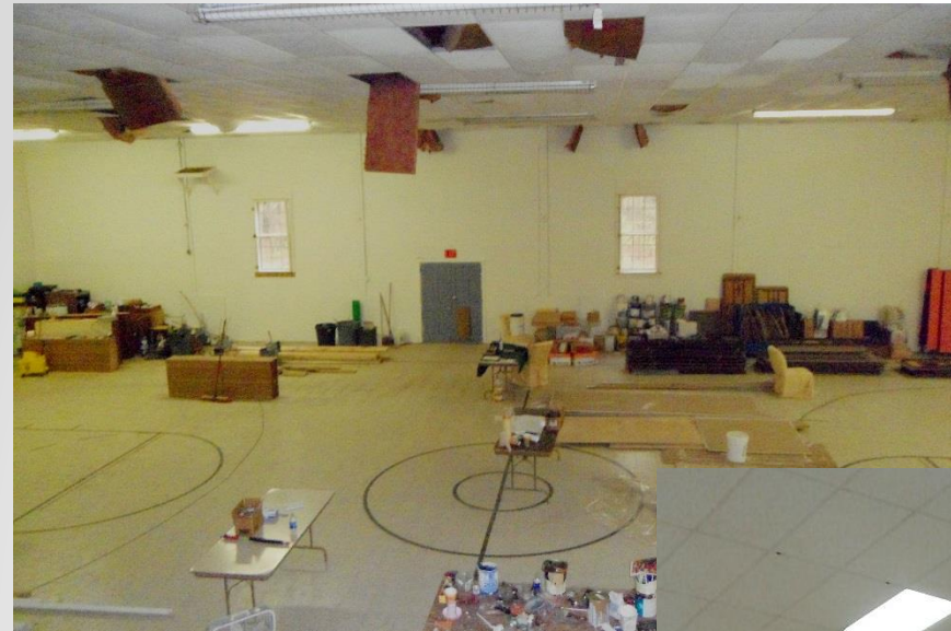
BEFORE ↑ at the Moncure Sprott Center