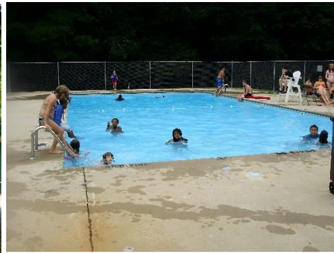
Northwest Park Pool