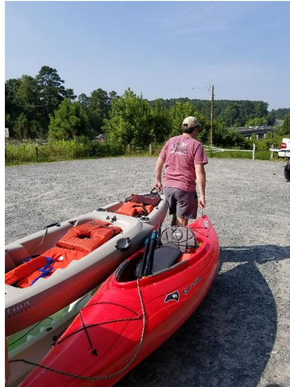
A man and his friends using the 15-501 North Parking Lot along the Haw River to put in for a day kayaking on the river.