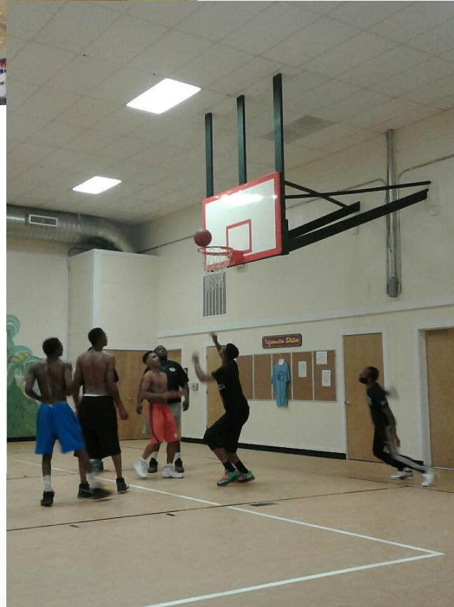
AFTER → at the Moncure Sprott Center