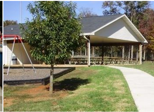
Southwest Park Kitchen/ Shelter