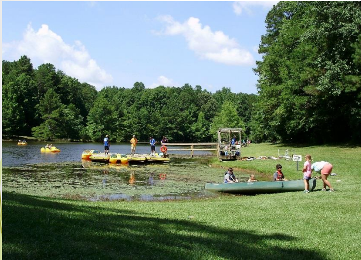
CCP&R Northwest Park Pond with Summer Campers enjoying canoeing or pedal boating