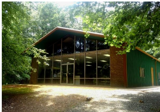
Northwest Park Dining Hall