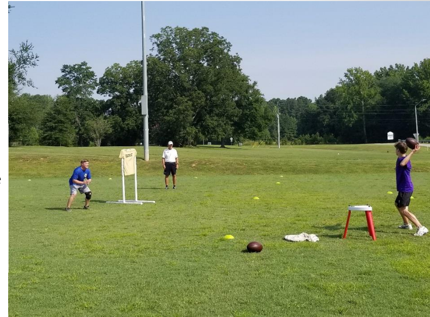
A boy, his father, and coach practice football at the Northeast District Park soccer field.