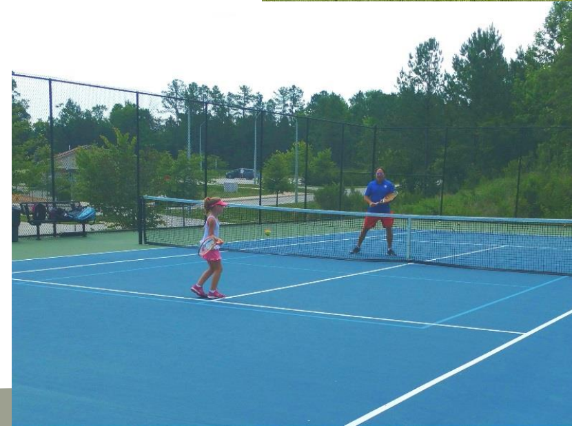
A girl and her dad practice Tennis on the Northeast District Park Tennis Courts