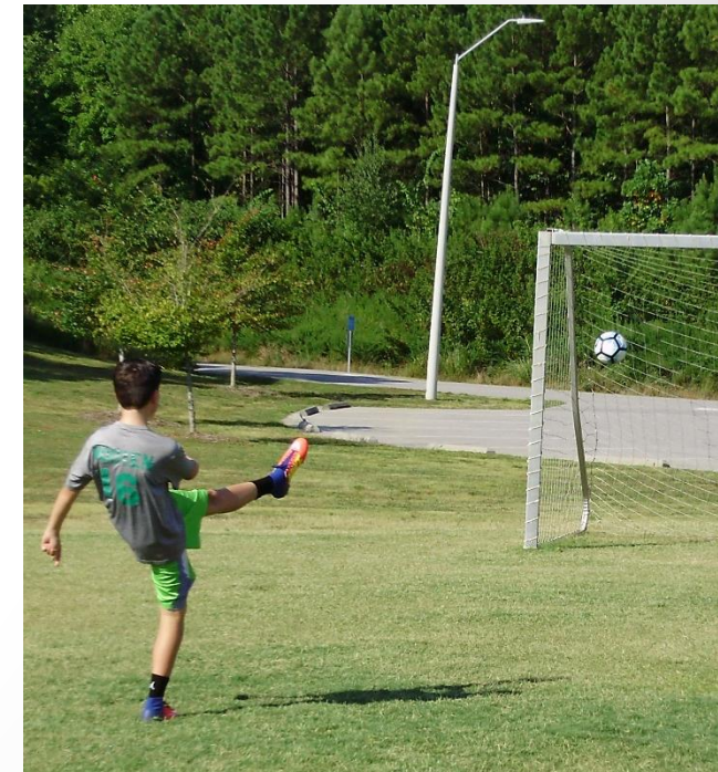
A Young boy is practicing soccer at Northeast District Park