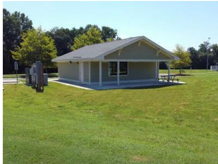
CCP&R Briar Chapel Park Concession Stand