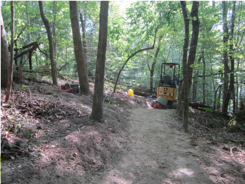
The Triangle Land Conservancy group used funds provided through the Recreation Agency Grant to restore trails at White Pines Nature Preserve.