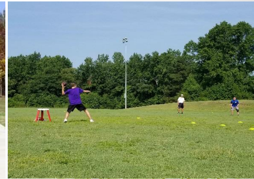
Briar Chapel Park Soccer Field