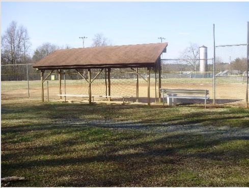
Earl Thompson Park Softball Field