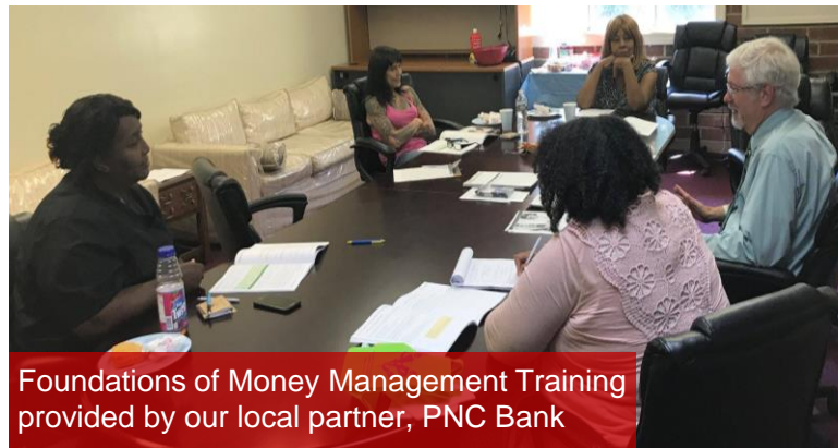
Foundations of Money Management Training provided by our local partner, PNC Bank