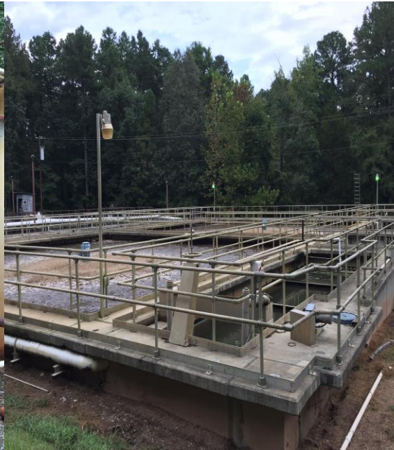
Carolina Meadows 350,000gpd WWTF designed for Carolina Meadows development