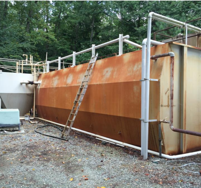
Cole Park Plaza 50,000gpd WWTF designed for retail shopping center; fully committed capacity