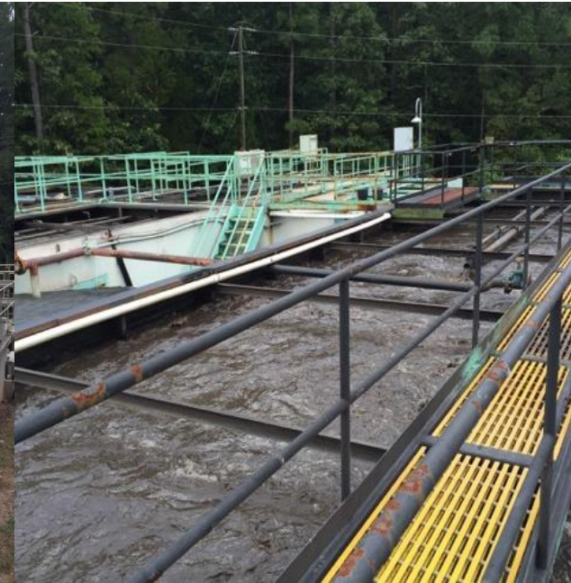
Governors Club 300,000gpd WWTF designed exclusively for Governors Club development, K-8 School, & potential North Chatham High School