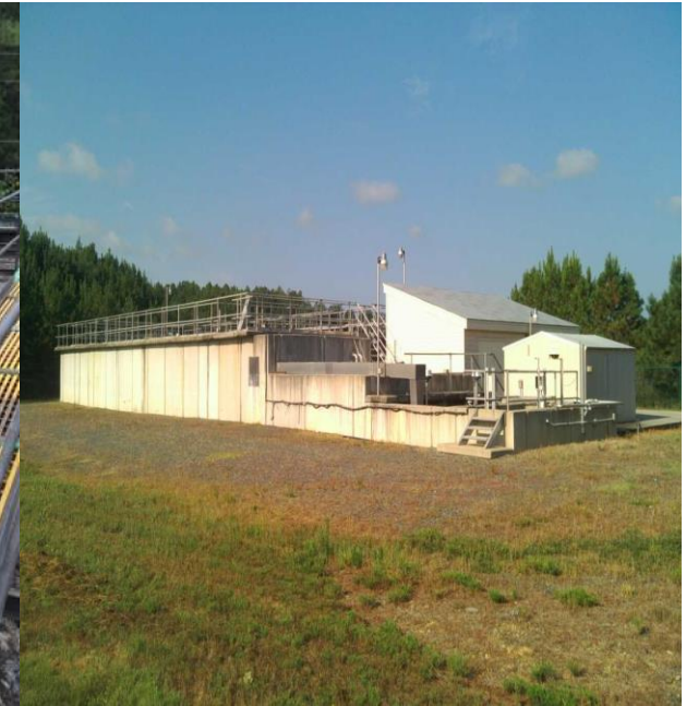
The Legacy @ Jordan Lake 185,000gpd WWTF designed for 463 SFRE, plus amenities and ESA